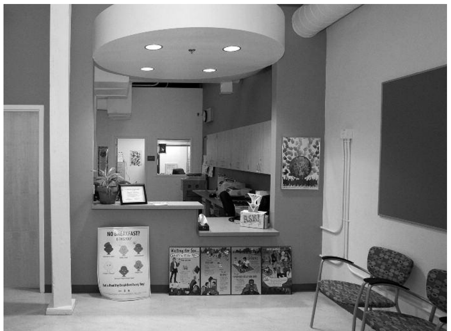
(Right) La Clínica's Roosevelt Health Center